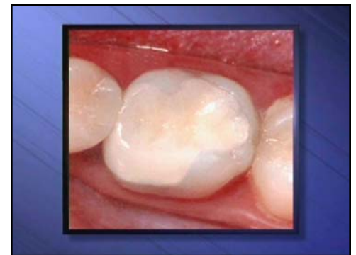
Porcelain onlays look natural

The next step is to take impressions of your teeth, which we then use to make models on which the dental laboratory will fabricate your porcelain onlay. Sometimes we put a small piece of string in the space between the tooth and the gum. We use the string to gently push the gum away from the tooth so that we can get a more complete impression. When we're finished, we place a temporary onlay in your tooth, which you'll wear until your next appointment when we place the permanent onlay.